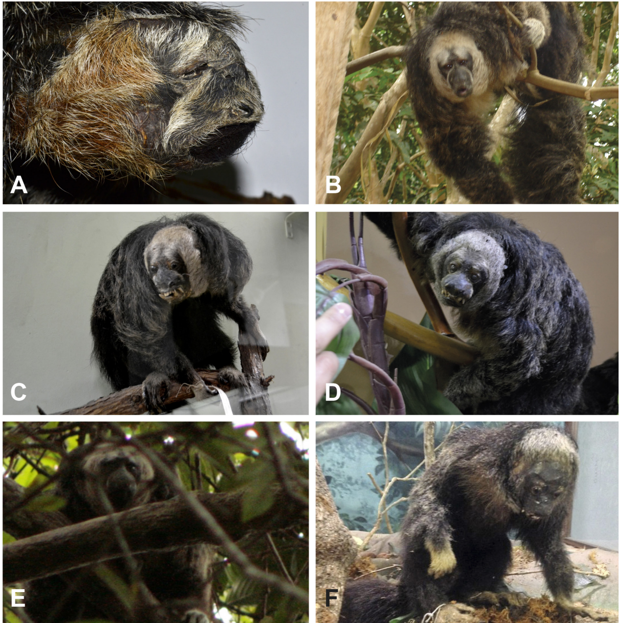
Figure 2. Confirmed records of Pithecia aequatorialis (Equatorial Saki) in Ecuador (all males). (A) Ecuador (no data) (MEPN 9163). (B) Pastaza, Enkerido (Waorani territory). (C) Ecuador (no data) (MCNM no number). (D) Ecuador (no data) (MAY no number). (E) Pastaza, Wiririma, Pintoyaku River (Zápara territory). (F) Pastaza, Conambo River (MMG MAM 3).

and fragmentation (Tirira, 2021b), conservation of the species is a matter of concern since there currently exist no protected areas within its range. This is due the fact that the proposed distribution area occupies different indigenous territories (EcoCiencia, 2021). These territories have a special status in Ecuador that does not allow the declaration of protected areas and the indigenous peoples are free to hunt primates and other wild mammals as a means of subsistence (Asamblea Constituyente, 2008), activity that can result in excessive and unsustainable hunting (Zapata Ríos et al., 2009).