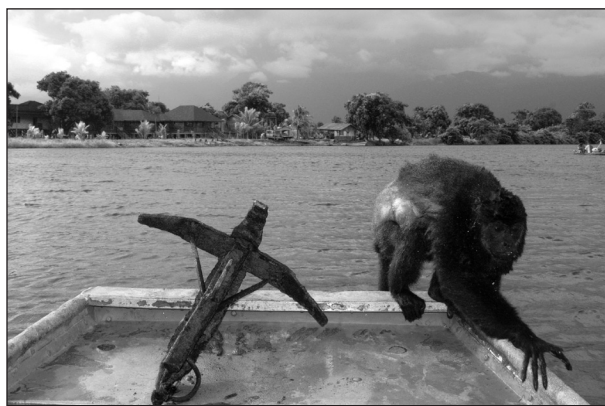
Figure 2. Photograph of the adult male mantled howler ( Alouatta palliata ) in Cuero y Salado Wildlife Refuge, Honduras, shortly after it climbed onto the front of research boat (7:38 am, 7/21/2005). The dugout canoe that first encountered it swimming can be seen on the top right and several buildings from the Salado village on the eastern shore on the left. The boat is traveling upriver heading southeast.