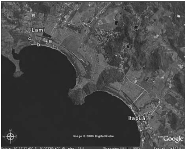
Figure 2. Southernmost area of Porto Alegre, and the neighboring city of Viamão, Itapua district. a, b and c are critical points where bridges for howler monkeys were installed in Lami, Porto Alegre, RS, Brazil.

dition to insulation, the three low tension cables must be braided forming only one cable, thereafter reducing the possibility of animal use. Since the first bridge was installed and critical areas were isolated accidents have become rare. One accident was recorded in 2005 in an already insulated area, which had its terminal poles exposed. Since then, the CEEE arranged to insulate all terminals. In 2006, another howler was hurt on high tension cables, in an area already requested to be insulated. The CEEE does not have a way to isolate this type of cables, so pruning was requested. These two last cases suggest that prioritized areas are actually being used by howlers and that they are exposed to danger. If cables are not insulated, they offer potential risks to the animals. Nowadays, to reduce accidents, CEEE has taken the responsibility for keeping cables insulated and trees cut. This legal decision in favor of wild animals was the first one in the country and might set a precedent in Environmental