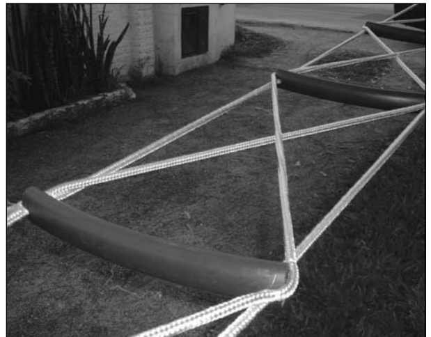
Figure 4. String bridge, 'ship ladder' model, before being installed in Lami, Porto Alegre. (Photo by L. X. Lokschin).