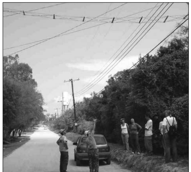
Figure 5. String bridge where howlers were seen crossing between forest fragments at Lami, Porto Alegre.