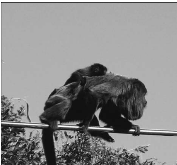
Figure 3. Howler monkeys ( Alouatta guariba clamitans ) using cables as a bridge, at Lami, Porto Alegre.