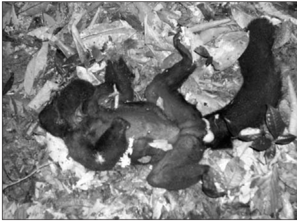
Figure 2. The adult male bearded saki, Chiropotes utabicki , killed by the harpy eagle. Note the feathers still in the hands.

bones of the postcranial skeleton were broken, the cerebral wounds would seem to have been the cause of death and were probably caused by the beak.