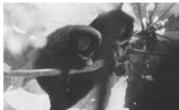
Figure 2. Callicebus lucifer , found on the north side of the Río Aguarico in Ecuador.

In all the forests we surveyed, hunting for food and pets was a major threat to primates. Though no systematic data were collected, the general impression we received from interviews was that hunting was mainly for subsistence for meat, and not for the commercial market. We did,