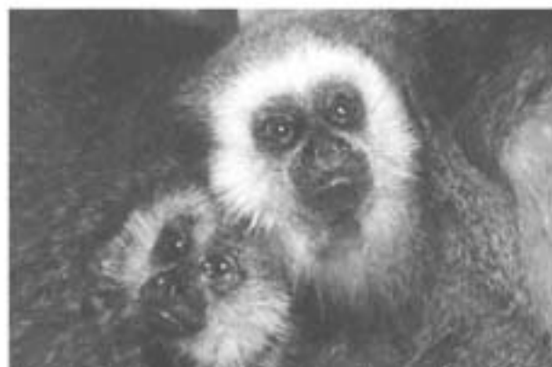
Figure 3. Callicebus oenanthe , found on the west side of the Río Mayo near Moyobamba, Peru.