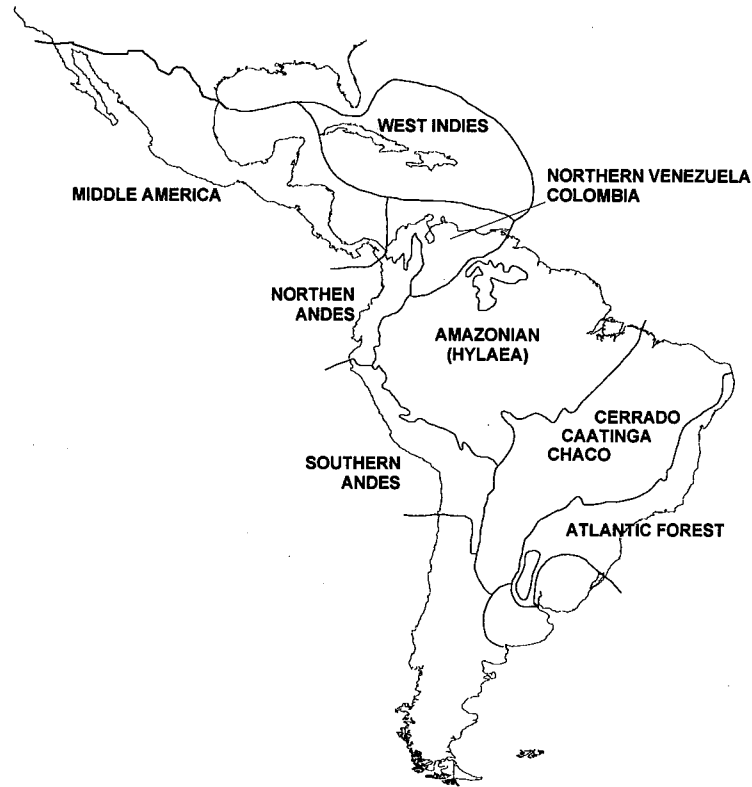
Figure 2. Major phytogeographic regions in the Neotropics [Gentry, 1982] (map by R. B. Machado)

3. There are 13 primate species and subspecies in the Northern Andean region, eight of which (61%) are endemic. Seven (54%) of the primates occurring in the Northern Andes are threatened. Five of the eight endemic primates (62%) are threatened.