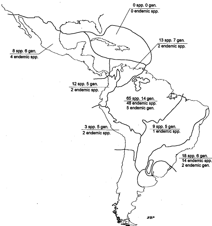
Figure 3. Number of Neotropical primates species and genera in each major phytogeographic region, with number of endemics indicated (map by R. B. Machado).

7. There are 23 primate species and subspecies in the Atlantic forest region, 17 of which (74%) are endemic. Eighteen (78%) of the primates occurring in the Atlantic forest are threatened. All of the 18 endemic primates are threatened.