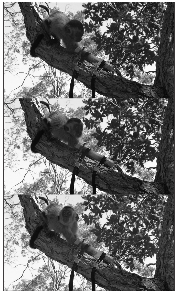
Figure 2. The tubes were fastened to tree trunks or branches by means of two straps located close to the extremities of the tube. A firm anchorage was necessary to prevent monkeys from dislodging the tube.

the tubes by exploring them (Fig. 3a, b). Testing occurred between 7.00 and 16.00. We presented the tubes on days without rain because wet hair does not adhere to the tape.