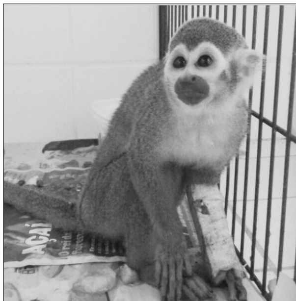
Figure 1. Confiscated adult female squirrel monkey ( Saimiri collinsi ) being rehabilitated at the Wild Animal Clinic at Federal Rural University of Amazonia (UFRA)

The area chosen for this action was as close as possible to the area where the animal was found. A group of squirrel monkeys was located and observed nearby, and the individual was released about five meters close to the group. Its interactions with the group members were observed and the primate vocalized towards them, obtaining vocal responses as the individual approached the group. No agonistic interaction was observed and the female then followed the group into the woods, suggesting a positive acceptance.