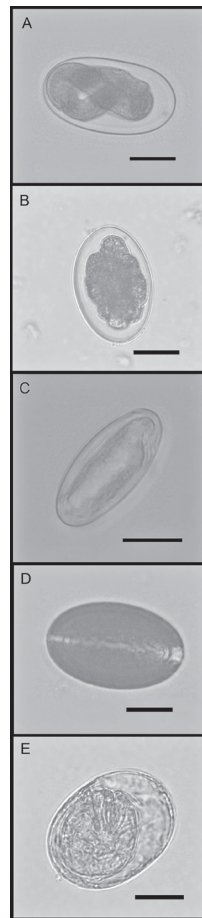
Figure 1. (A–E) Light microscope pictures of parasite eggs recovered from fecal samples of Squirrel monkeys ( Saimiri collinsi ) in Pará, Brazil. (A) Strongyloides sp., (B) Trichostrongylidae, (C) Trypanoxyuris sp., (D) Prostenorchis sp., (E) Taeniidae, scale bar = 20 \mu m.

We sampled 13 wild squirrel monkeys, including adult females, adult males and juveniles. As shown in Table 1 and Figures 1 and 2, several types of helminthic parasites were found (Nematoda, Cestoda and Acanthocephala). In particular, we found that the intestinal nematode Strongyloides