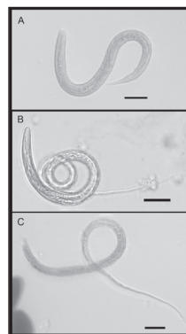
Figure 2. (A–C) Light microscope pictures of nematode larvae recovered from fecal samples of Squirrel monkeys ( Saimiri collinsi ) in Pará, Brazil. (A) Strongyloides sp., (B–C) Filariopsis sp, scale bar = 20 \mu m.

sp. was present in 100% of sampled material. According to Dunn (1968), this soil-transmitted parasite can be pathogenic when the infection is heavy.